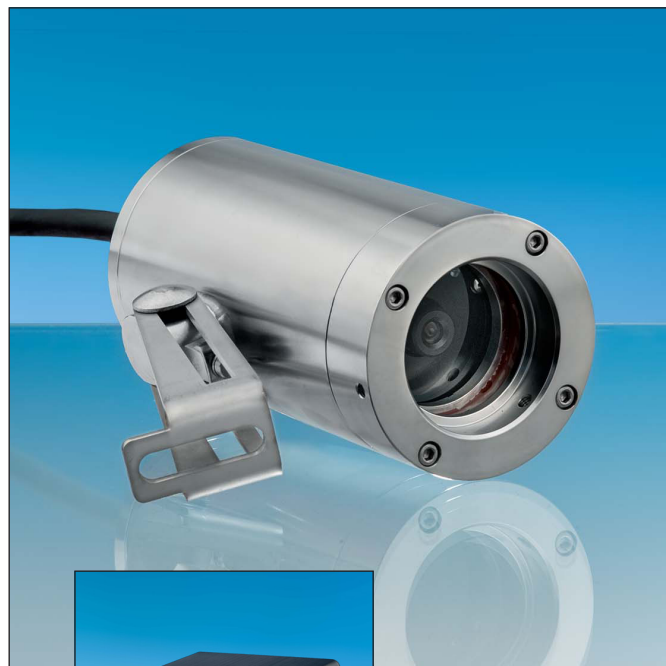
VISULEX camera K55P-Ex with fixed lens