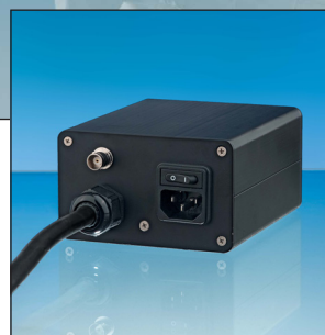
Terminal box for VISULEX camera K55P-Ex