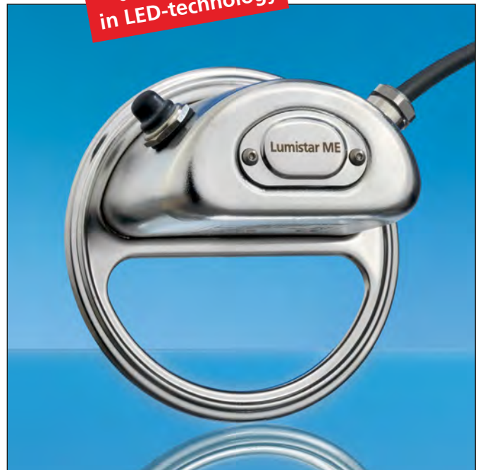
Lumistar luminaire ME, stainless steel