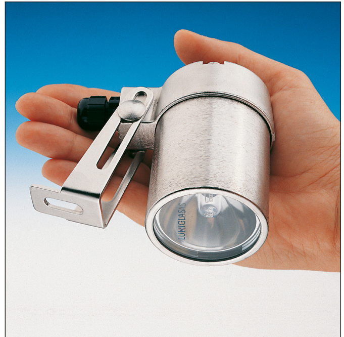
Lumistar luminaire USL 03 in stainless steel